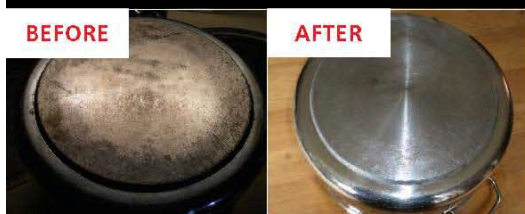
Before & after treatment with Innosoft B570