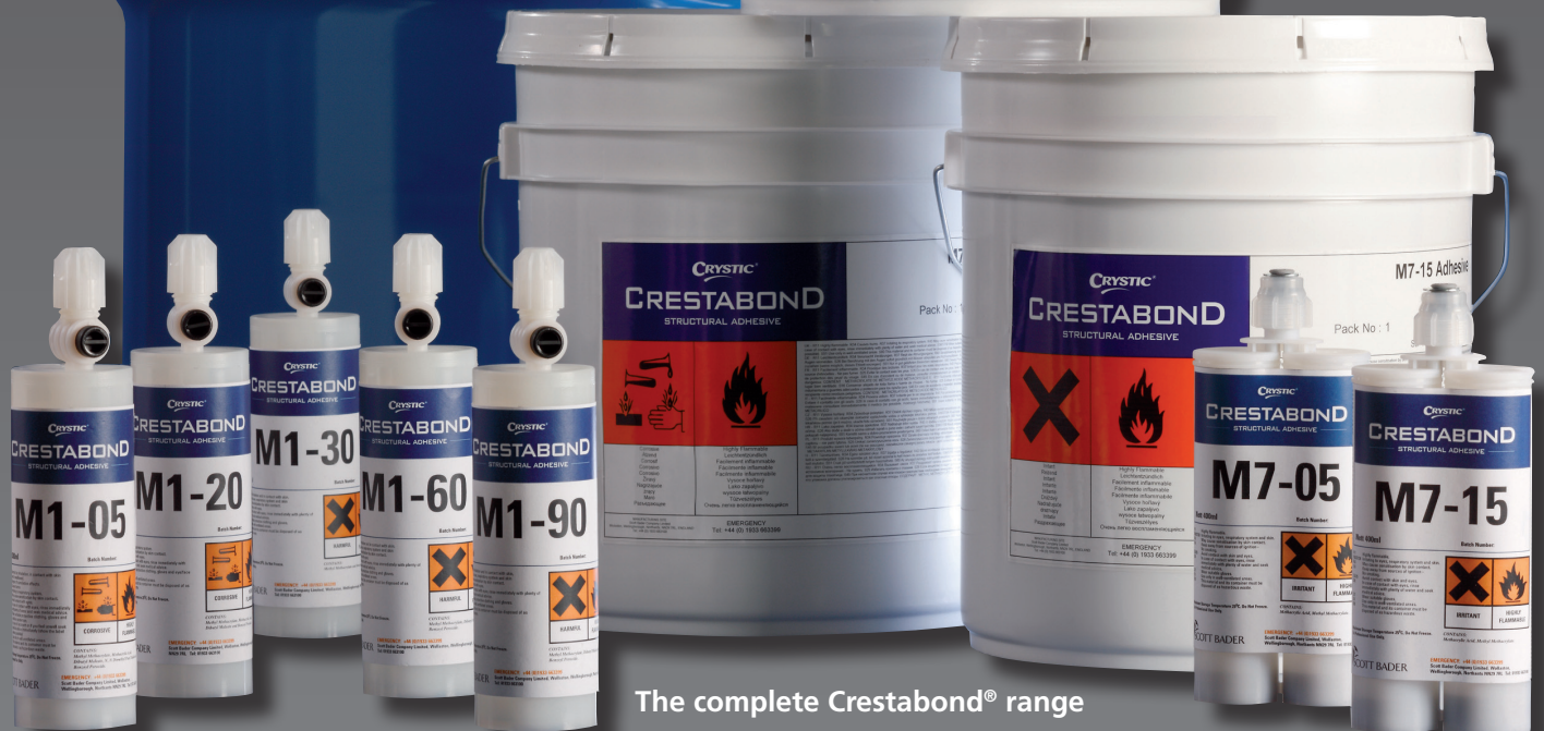
The complete Crestabond ® range